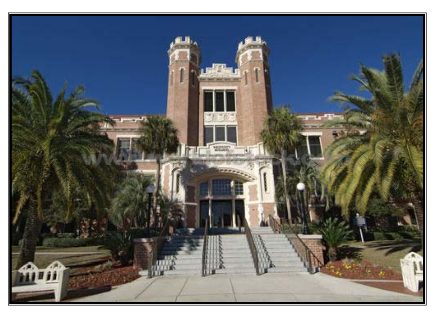
Established 1851 Current enrollment 40,000